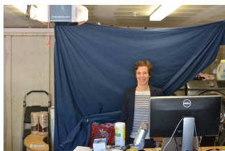
Figure A.2: And the washing machine.

I am writing this dissertation amid our domestic routine which governs our current lives like a desert storm. Two children. One and four naps, respectively, but never at the same time. Three meals and one snack (did we always eat so much? We can no longer seem to remember). One walk. Two baths. Laundry. Cooking. Cleaning. Sleep—for those of us who need not work at night. And within this routine joy resides and wonder flowers of growing bodies and brains.