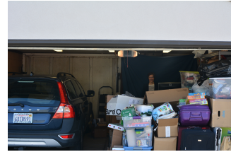
Figure A.3: Behind the boxes.

And yet, they do come, alone together and together alone. Committees meet, listen, and approve over remote video conferencing dotted with a chocolate truffle and a cup of Peet's (Figure A.4). Faraway family members enjoy, in the darkness of night, a unique opportunity to join in a ceremony that would have been inaccessible to them in any normal times. Others who have left before us and spread around this vast country (Figure A.5) can take advantage of the situation and come to a party—each with their time zone and glass of wine. Trying to overcome the awkwardness of disembodied Charades for a brief opportunity to feel together again. Thank you all so much for coming (Figure A.6), and so long.