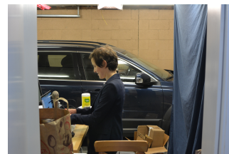
Figure A.1: Next to the car.

And once in a while, we emerge out of domesticity into our other spaces. Into these nooks and crannies of work, where there are screens, keyboards, cameras, and microphones. Where we need, for example, to don a suit jacket matched with pajama pants to defend our dissertation or give a job talk in front of no one, talking to ourselves while being watched by tens of disembodied people. And yet, here we are, next to the car (Figure A.1) and the washing machine (Figure A.2), behind all the boxes we failed to return before the lockdown, silent reminders of the time we used to have and the spaces we used to allow