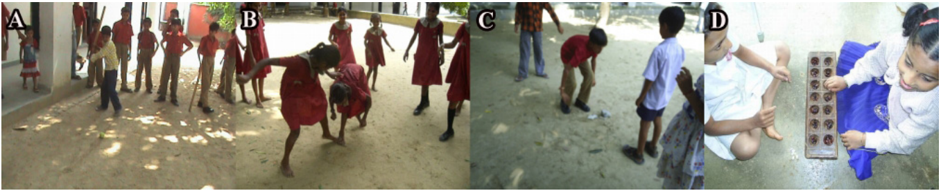
Figure 2. Some of the traditional village games that children in India play: (A) Gucchi Garam, (B) Siya Satkana, (C) Giti Phod and (D) Halla Guli Mane. In (A), a player stands in the safety of his circle and deflects a ball before it hits him. In (B), a player reaches to pick up the stick while avoiding being touched by the “it” player. In (C), a team attempts to rebuild the rocks into a heap while avoiding a ball thrown by the opposing team. In (D), players aim to move all the tamarind seeds into one crevice on the tray.

goal of Frogger. On the other hand, more than 50% of the participants in all three groups did not appear to find the process of exploring the Train Tracks game world to lay the railroad to be clear. Similarly, they seemed confused with the “bait” subgoal in Crocodile Rescue and did not attempt to achieve it in many cases.