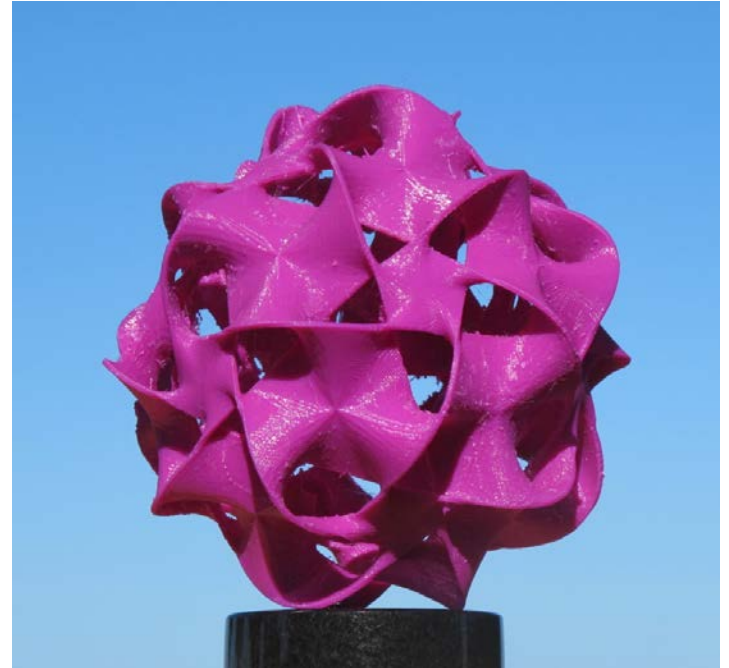
Single-sided soap film filling in the regular N-gonal facets.