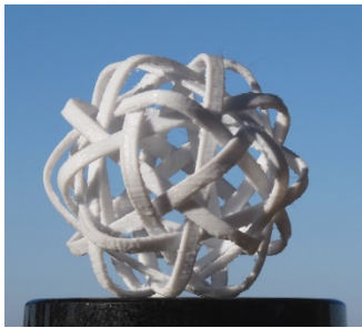
Basic Icosahedral Tangle.