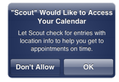
Figure 1. A calendar permission request for the Scout app including a developer-specified purpose string explaining the reason for the request.

http://dx.doi.org/10.1145/2556288.2557400